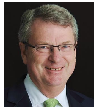
(Below) Looking forward to remarks by Sir Lynton Crosby AO, AALS Annual Dinner rescheduled for 4 November 2021, the Old Hall, Honourable Society of Lincoln’s Inn