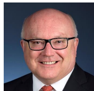
Australia's High Commissioner to the UK, His Excellency the Hon George Brandis QC